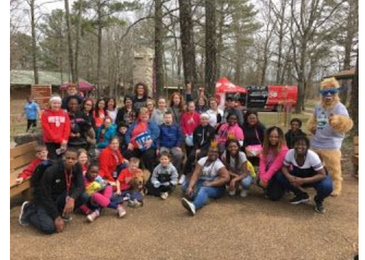
Whiteside Middle School students celebrate Special Olympics 50th Anniversary at Touch of Nature in Giant City, IL.