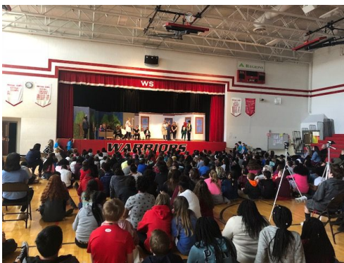
Whiteside Middle School students watch the first performance of the school play Law and Order: Fairy Tale Unit.